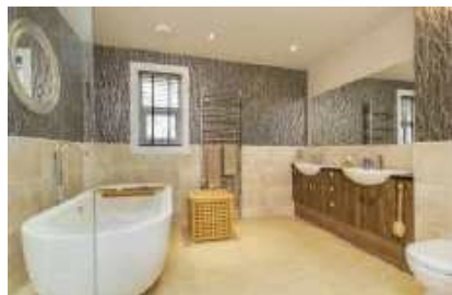
Greendale Robertson Mains, Dolphinton EH46 7AB